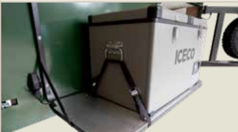
Optional 65 Quart Dual-Zone 12V Fridge/Freezer