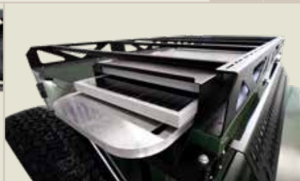
Squatch Box Holds (2) Solar Panels & Camp Table