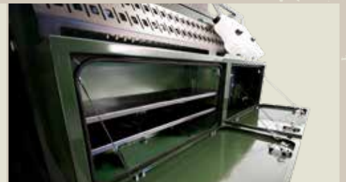
Available Adjustable Side Box Shelving